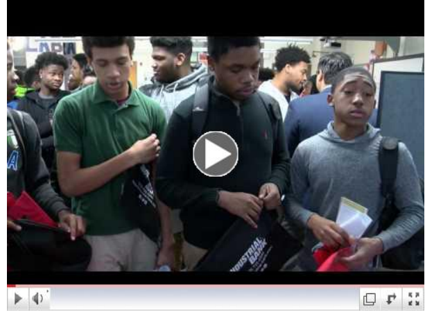
District Minute 1/11/17

Click HERE to watch District Minute's from previous weeks!